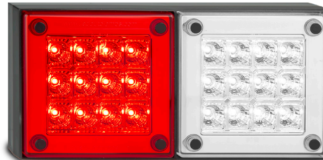
Stop/Tail/Reverse 280RWM - Blister, 12-24 Volt

Approvals Function Approval No. ECE Stop/Tail R1-S1-E9-02.11545 ECE Indicator 2a-E9-01.11544 ECE Reverse AR-E9-00.1207 CTA Stop/Tail/Ind CTA-060088 CTA Stop/Tail/Rev CTA-060088