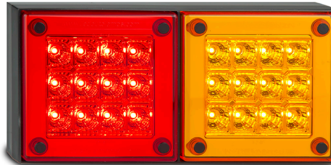
Stop/Tail/Indicator 280ARM - Blister, 12-24 Volt

Function Stop/Tail/Indicator Stop/Tail/Reverse Size 190mm x 95mm x 28mm Voltage Multivolt 12-24V LED Qty 24 Cable 40cm cable