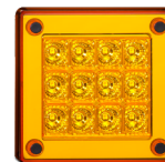
Part No. 280AM Replacement Lens