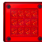
Part No. 280RM